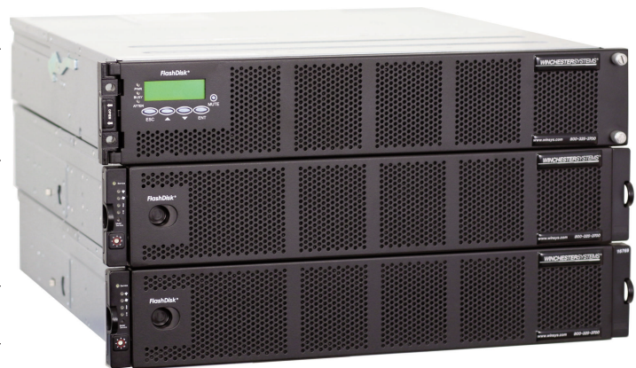
FlashDisk AFA - Front View - Fully Expanded with Two Expansion Shelves