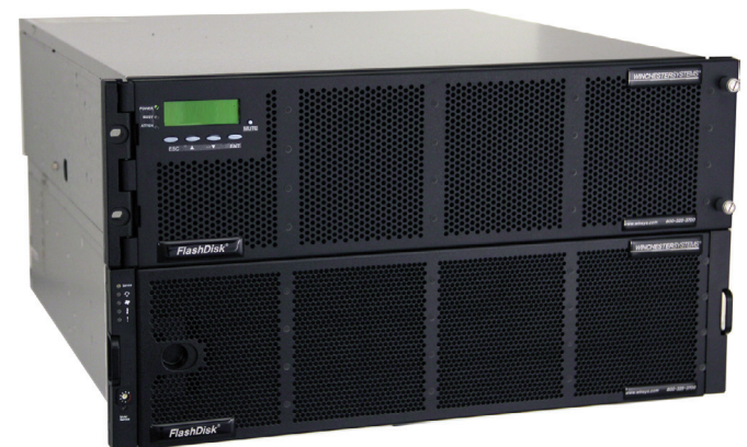
FlashDisk HX - Front View - Shown with one 3U, 16-drive expansion shelf.