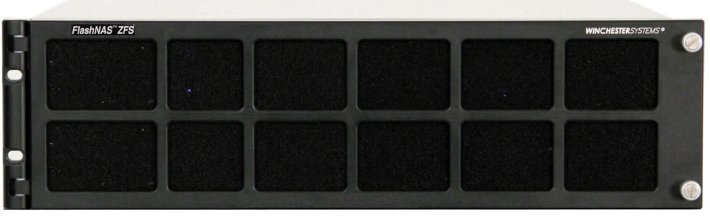
FlashNAS ZFS RZ-3U16. Expandable to 240 disks with fourteen 3U expansion shelves.

FlashDisk RZ-3U16 is a rugged version of the commercial ZX-3U16 with the same performance levels and Fibre Channel and iSCSI host support. However, these "COTS Rugged" ZFS storage systems are designed to store and protect data in harsh operating environments: tolerating levels of dust, moisture, shock and vibration not possible with standard commercial units - at far less expense than fully rugged systems. It supports 16 SAS disks (HDDs or SSDs) per shelf and provides up to 128 TB of storage in the base unit, expand-