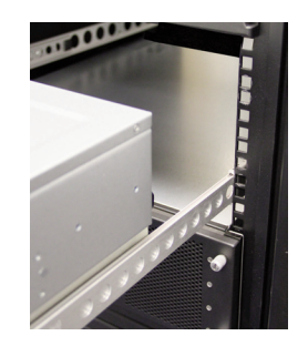
Rugged unit on mounting tray with aluminum ballbearing rails fully extended for rear access.