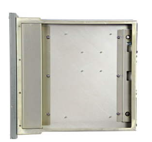
Interior view of mounting tray.